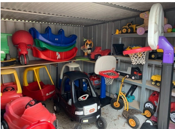
Toy Party Pack